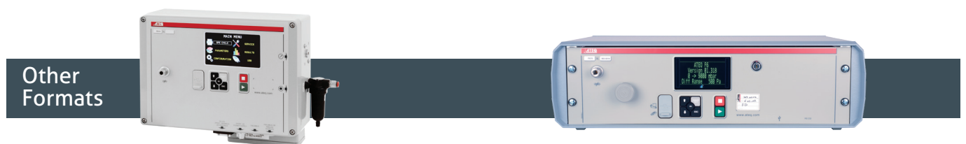
F610 WATERPROOF CASE